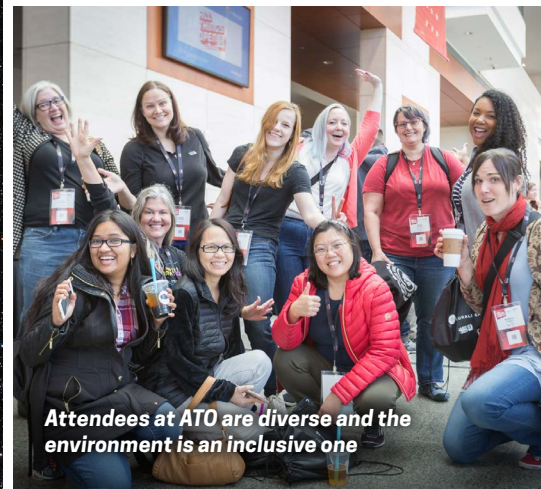
Attendees at ATO are diverse and the environment is an inclusive one